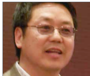
CPSA Shanghai Program Chairs: